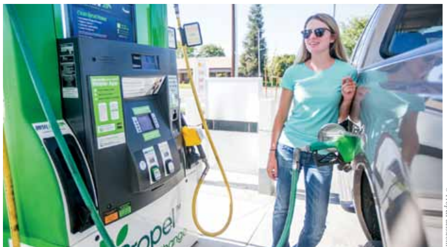
Renewable diesel (above) and other clean fuels are gaining greater market share thanks to California's Low Carbon Fuel Standard, helping to not only reduce the transportation sector's global warming impact but also give consumers more clean fuel options.

California's LCFS requires petroleum refineries and fuel importers to reduce global warming pollution associated with the fuels they sell. The program regulates the "carbon intensity" of fuels, which is a measurement of global warming